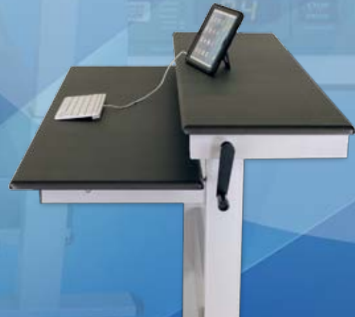
Tablet and keyboard not included.