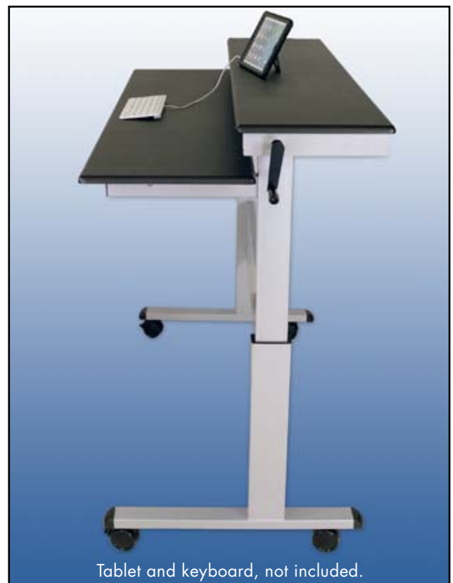
Tablet and keyboard, not included.

Stand-Up Desk available separately... Model SUD60