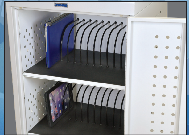
Storage for up to 30 tablets or netbooks