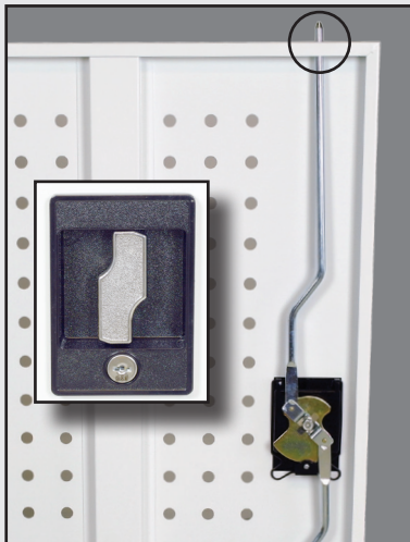
Secured by keyed locking bolts on top and bottom of cart.