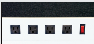
Four (4) external outlets for accessible spontaneous charging.

The MCC10B is an affordable solution for charging, securing and transporting up to 30 tablets or netbooks. Rubber coated dividers and padded shelves provide protection to your devices. Plenty of ventilation allows air to circulate freely through the unit. The MCC10B includes a bottom inner shelf, two 16-outlet vertical electrical outlets and 4" wheels with locking brakes. Front and back doors lock with a traditional key system for secure storage and peace of mind knowing your investment is protected.