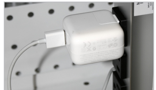
iPad charger plugged in