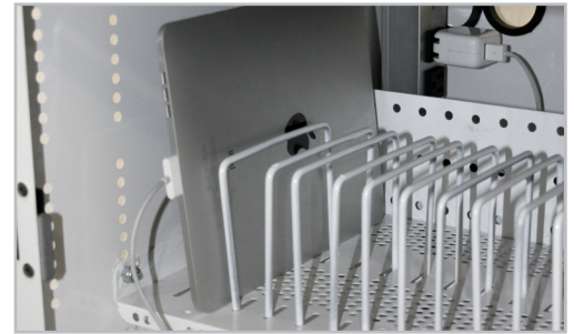
Front of cabinet with iPad (not included)