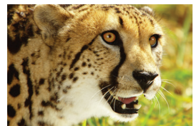
AFTER auto wall correction