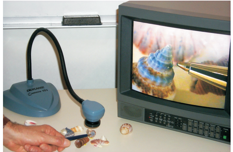
Camera 101 in a typical set-up viewing a small object.